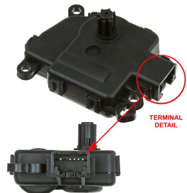
gpd #1712295 2007–2014 Ford Expedition 131” Wheel Base