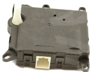
gpd #1711895 2002–2006 Ford Expedition